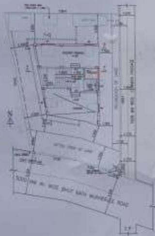
PROPOSED GROUND FLOOR