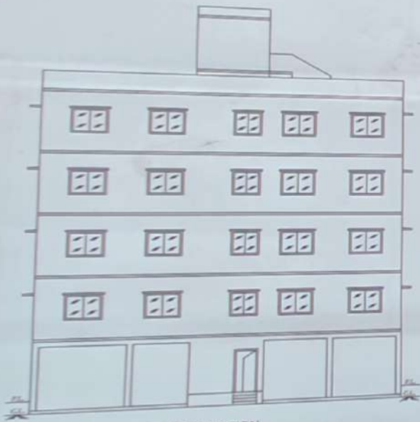
FRONT ELEVATION SCALE :- 1:100